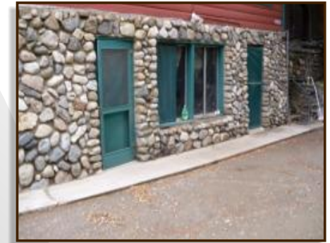
The front yard shown above was a constant source of dust inside the house.

Dust around the house can cause respiratory illness and destroys our furniture and home office equipment. It's simple to treat your house. Using DustLockerTM is the smartest way to stay dust free all season.